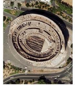
DigitalGlobe worldwide imagery